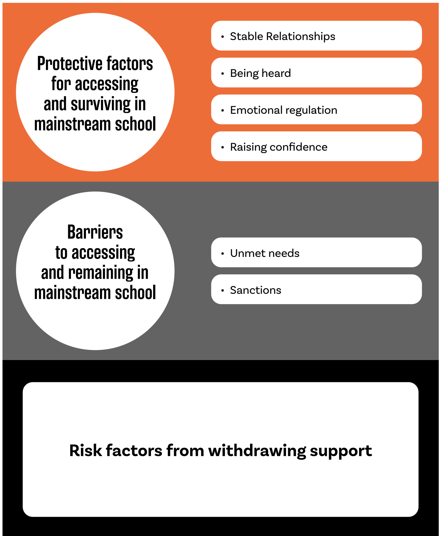
FIGURE 7. Final themes and subthemes